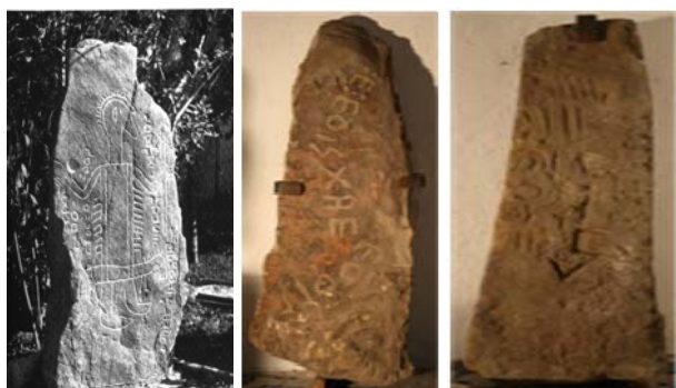
Stele of Kerfala Stele of Sibaou Stele of Agouni Goughrane

According to M.Ghaki [6] the vertical writing would be the oldest, the most current which is lasted more, it is the first orientation which is maintained in spite of the contact with other writings having a different orientation.