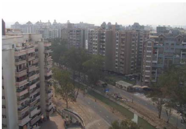
Fig. 1 Proposed Dumas resort-canal road BRTS Corridors of Surat City

However, the population of car in Surat is found less than 75 per 1000 persons. The CO 2 emission for Surat is estimated around 0.035 tons per capita per year. The CO 2 emission is likely to increase as people shift from non- motorized to Two-wheeler and Two-wheeler to Car due to economic growth. Seven corridors are proposed to implement Bus Rapid Transit System in Surat as shown in Fig. 1. The selected corridor for study is Dumas resort-canal road-Sarthana- Jakaatnaka road, which is 23.5 km long.