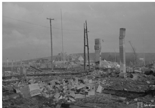
Fig. 2 The destruction of WWII was heavy particularly in Northern Finland. As a result of the war some 40–47% of the dwellings in the area were destroyed, and the provincial capital of Rovaniemi was burned to the ground