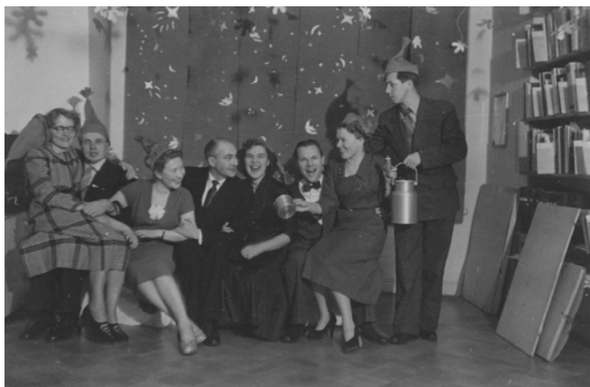
Fig. 5 The personnel of Building Standards Committee was still limited in 1950's. Christmas' Party

were to be built both sturdy and particularly warm, which further increased building costs. Research done in the field of building, as well as the standardisation work utilising the results of the research, would have a significant role in keeping those costs under control [14]. Koiso-Kanttila's related speeches and article drafts from the 1950s show his true passion for the work at hand.