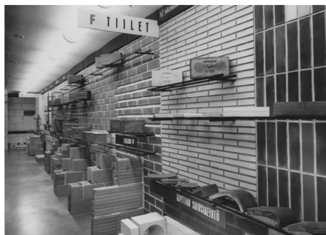
Fig. 6 Erkki Koiso-Kanttila renewed the Permanent Building Products Exhibition using SfB classification system

Koiso-Kanttila renewed the exhibition space, as well as the exhibition itself, quite thoroughly. By means of skilled exhibition design he was able to fit plenty of exhibition material into the space without creating a feeling of overcrowdedness. For example, the wall surfaces doubled as a paint exhibition, the floors as a floor covering exhibition and the balcony railing as a sheet glass exhibition. Material exhibitions additionally had information for instance about the costs, heat insulation and breathability of the materials, as well as other important information to be taken into consideration when choosing building materials [18].