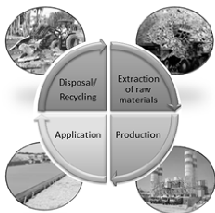
Fig. 1 Specification of evaluated areas of Life cycle assessment

In this section, subjects of evaluation (fly ash concrete - FAC and standard concrete – SC roads) as well as the functional unit of LCA (1m 3 f.c.) have been determined. System boundaries were selected from “cradle to grave” and determined to 4 areas (Fig. 1). Qualitative, environmental, economic and health-hazardous parameters were monitored in every area of life cycle (extraction – production – use – demolition). Impact of machines production and other used facilities in various processes, the use of demolition products, and effects of demolition products during the period of landfill as well as the assessment of mixing water were not included in the system boundaries.