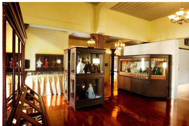
Fig. 6 Thai puppet exhibition in the learning center

The evaluation process consists of planning, data collection and evaluation. During planning, the managers and planners need to identify the target, the indicators and milestones, data collecting methods and evaluation period for evaluating marketing activities. However, to identify what data to collect, the planners need to consider the limits of time and resources.