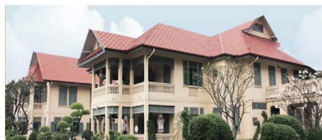
Fig. 1 The main learning center [3]