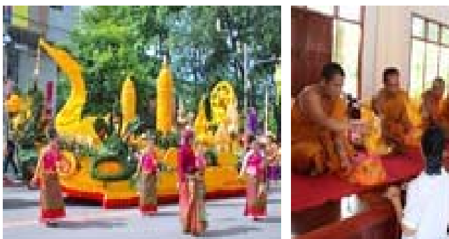
Fig. 27 Main activities of Khao Pansa Festival in Thailand

It is the period of 3 months of Buddhist Lent. During this period, coinciding with the rainy season, Buddhist monks and novices remain closeted in their particular Buddhist temples, and discouraged from spending nights elsewhere. In Khao Pansa Festival, there are 2 main important things which Thai Buddhist presented to monks: the large candles are carried by beautiful processions, and garments worn by monks, especially the bathing robes [12].