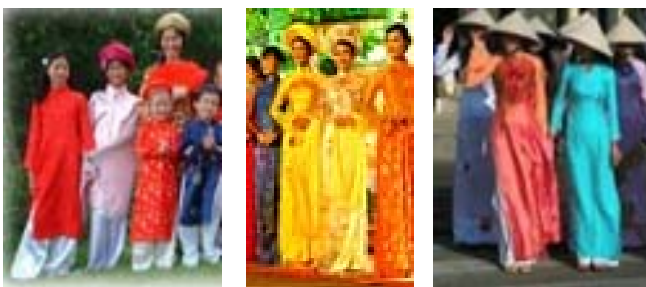
Fig. 37 Vietnamese Buddhist women's costumes for Buddhist festivals