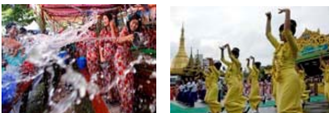
Fig. 21 Main activities of Thingyan Festival in Myanmar

This is the Myanmar New Year Festival and the Water Festival. During the festival, Myanmar people pour water over one another to the melodious tunes of singing and dancing at the decorated pavilions. Pouring water signifies cleansing the body and mind of evils of the past year, performing a lot of meritorious deeds to usher in the New Year such as going to pagodas and monasteries, offering food and alms to monks, paying respect to parents, teachers and the elders, setting free fish and cattle and so on.