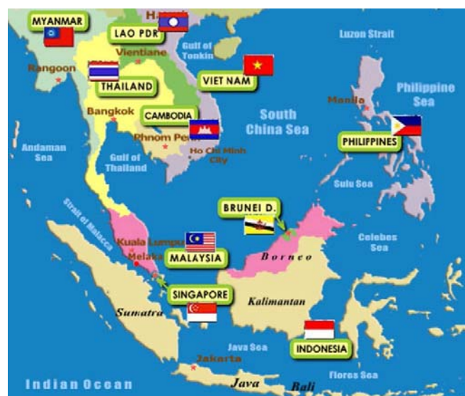
Fig. 1 Map of ASEAN countries

A. The Major Religious Festivals of Merit Making and Joyful Celebrations (Nationwide) in Each Country of ASEAN Countries