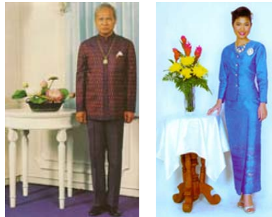
Fig. 38 Most popular costumes for religious festivals in ASEAN countries