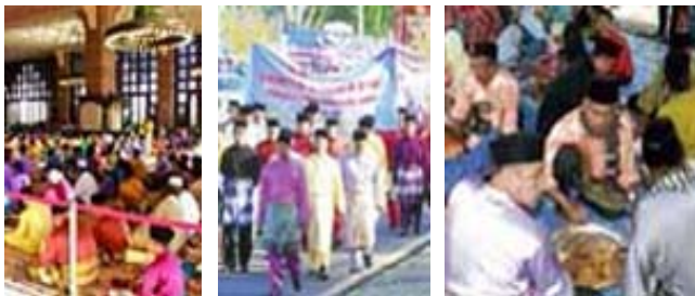
Fig. 16 Main activities of Maulidur Rasul Festival in Malaysia

It is the festival of Prophet Muhammad's Birthday; celebrated by special prayers and sermons in mosques, followed by processions and banquets.