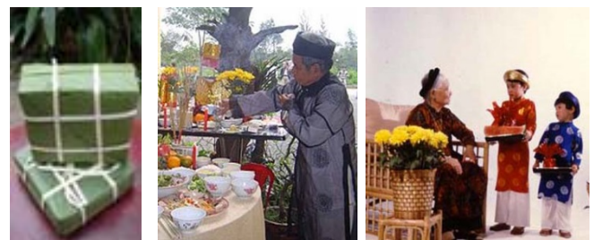
Fig. 29 Main activities of Tet Nguyen Dan Festival in Vietnam

Tet Nguyen Dan Festival is the celebration of Vietnamese New Year. In this festival, Vietnamese Buddhists cook special foods, clean the house, worship the spirit of dead ancestors, wish New Year's greetings, and give lucky money to children [13].