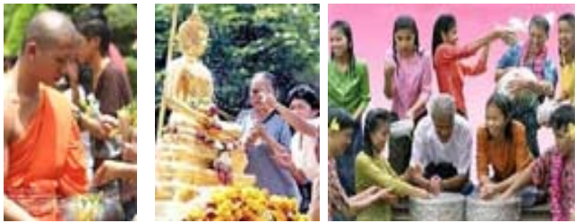
Fig. 25 Main activities of Songkran Festival in Thailand