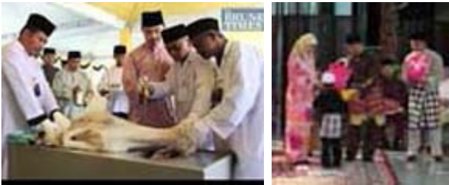
Fig. 2 Main activities of Hari Raya Aidiladha Festival in Brunei

Sacrifices of goats and cows are practiced to commemorate the Islamic historical event of Prophet Ibrahim; then its meat is distributed among relatives, friends and the less fortunates.