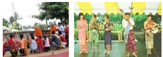
Fig. 13 Main activities of Boun Khao Pradabdin Festival in Laos

It is the celebration devoted to remembering and paying respect to the dead. Lao Buddhist devotees visit local temples to make offerings to the deceased as well as to share merit-making. Music is traditionally performed in the grounds of the temple while people make their donations. This nationwide festival includes boat racing on the Nam Khan River and a trade fair in the center of Luang Prabang, the World Heritage Town.