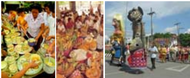
Fig. 26 Main activities of Sart Thai Festival in Thailand

It is the festival of making merit traditions and the honoring ghosts & ancestors of Thai Buddhists. This traditional festival is now celebrated mostly in Thailand's southern provinces, especially in Nakhon Si Thammarat, and other parts of Thailand. It has many features of animism, attributing souls or spirits to animals, plants, and other entities [12].