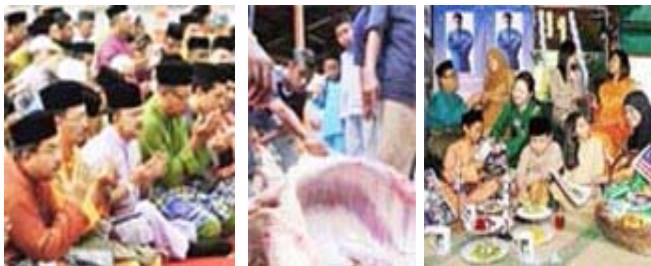
Fig. 15 Main activities of Hari Raya Aidil Adha Festival in Malaysia

Malaysian Muslims celebrate the festival with prayers and the sacrifice of cattle in local mosque, and their meat are distributed to all. It is also the festival of family reunion.