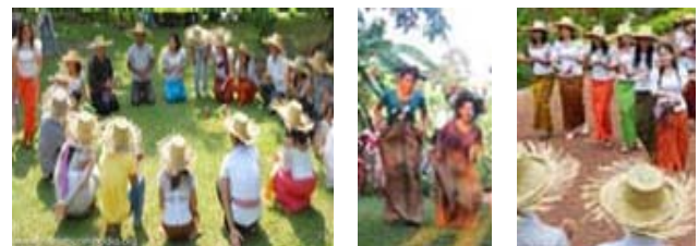
Fig. 6 Main activities of Khmer New Year Festival in Cambodia

Khmer people visit local temples to make offerings to monks, engage in traditional Khmer games and merrily dance Khmer forms in the open.