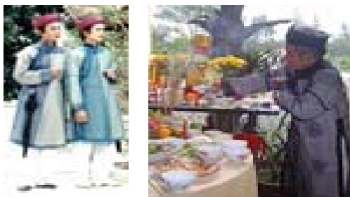
Fig. 32 Vietnamese Buddhist men's costumes for their religious festivals