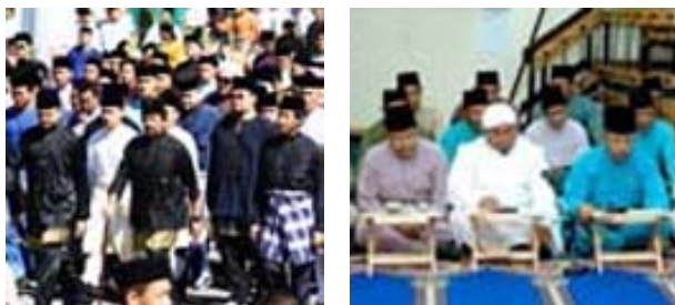
Fig. 3 Main activities of Mauludin Nabi Festival in Brunei

Prophet Muhammad's Birthday celebration is celebrated by conducting processions on foot through the main streets of the city, religious functions, religious lectures and other activities.