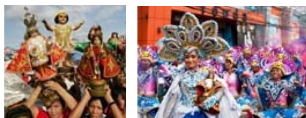
Fig. 23 Main activities of Feast of the Santo Niño in Philippines

It is a celebration for the Holy Child Jesus, a miracle worker, known as El Santo Niño de Atocha, celebrated by colorful parades, fluvial processions and street dancing.