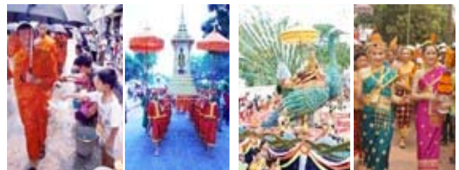
Fig. 12 Main activities of Boun Pi Mai Festival in Laos

This is the celebration of Lao New Year. For this festival of joyous spirit, Lao Buddhist people wear new clothes, Buddha images are washed, temples are repainted, homes were cleaned; thousands of sand stupas are built with their colorful banners and offerings; people gently sprinkle water on one another as a sign of respect; conduct the procession of the sacred Prabang Buddha image, procession of Nang Sangkhan (Miss New Year), and conduct the parade wearing traditional Lao costumes with music and dance.