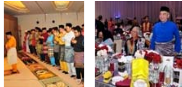
Fig. 17 Main activities of Hari Raya Aidilfitri Festival in Malaysia

It is the celebration after the end of the Ramadhan fasting month. Malaysian Muslims attend special morning prayers in mosques, visit the cemeteries of their loved ones, and take a week off to return to their home towns or village to meet family and friends. Many people host "open house" feasts during Hari Raya, where friends and family gather together to celebrate. Buying (and wearing) new cloth is also a feature of the festival.