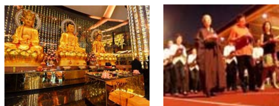
Fig. 24 Main activities of Festival of Vesak in Singapore

Festival of Vesak Day is an annual commemoration of the birth, enlightenment and death of the Buddha; celebrated by chanting of mantras, releasing of caged birds and animals, having vegetarian meals, bathing and illuminating statues of the Lord Buddha, and concluding with a candlelight procession through the streets [10].