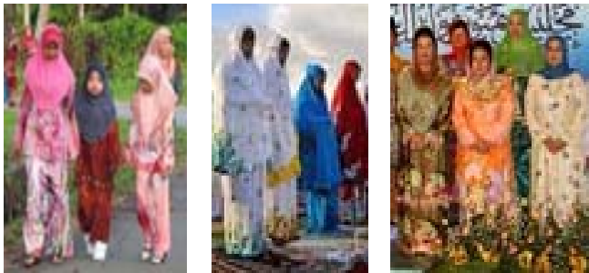
Brunei Darussalam Indonesia Malaysia