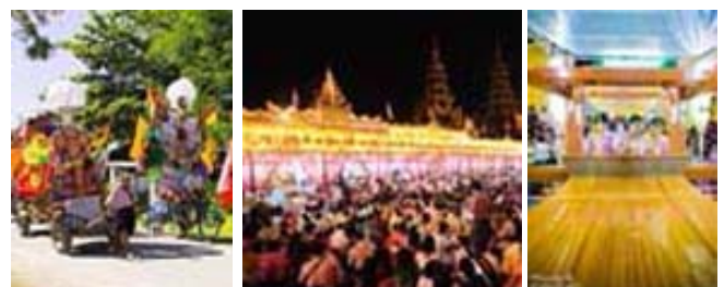
Fig. 19 Main activities of Tazaungmon Full Moon Festival in Myanmar

This festival is a celebration for the season of the offering robes and other requisites needed by monks after the end of Buddhist Lent. Cash offerings for monasteries are also collected and displayed on wooden frames built in the shape of a tree. There is the special offering of Mathothigan, or timely woven robes, a robe that is woven in one single day, held on the night of the eve throughout to the full moon day. There are weaving competition to complete the robes, which are offered to images of Buddha.