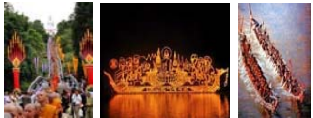
Fig. 28 Main activities of Awk Pansa Festival in Thailand

festival is celebrated by illuminated boat processions in the evening and by boat races during the daytime [12].