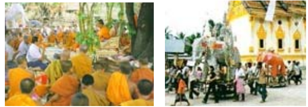
Fig. 11 Main activities of Boun Pha Vet Festival in Laos

It is the celebration of the birth of Prince Vessantara, or Pha Vet, the Buddha's penultimate existence. Lao Buddhist people believe that when people listen to his story, it means they get a lot of merits. In addition, there are play roles ceremony to invite Pha Vet in the forest back to the palace.