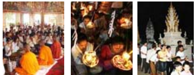
Fig. 5 Main activities of Pchum Ben Festival in Cambodia

Khmer people bring food to the temple for the monks and to feed hungry ghosts who could be their late ancestors, relatives or friends. Pagodas are usually crowded with people taking their turn to make offerings and to beg the monks to pray for their late ancestors and loved ones; many remain behind at the temple to listen to Buddhist sermons.