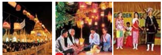
Fig. 18 Main activities of Festival of Lights in Myanmar

This is celebrated at the end of Buddhist Lent. This festival commemorates the time when the Buddha returned to the earth after preaching in the abode of celestials during the three months of Lent. He descended at night and devotees greeted him with lamps and lanterns. So people decorate their houses with candles and colored lanterns. Pagodas are crowded with people in doing of meritorious deeds so it is not only a time of joy but also of thanksgiving and paying homage to parents, elders. There are concerts and theaters in every city.