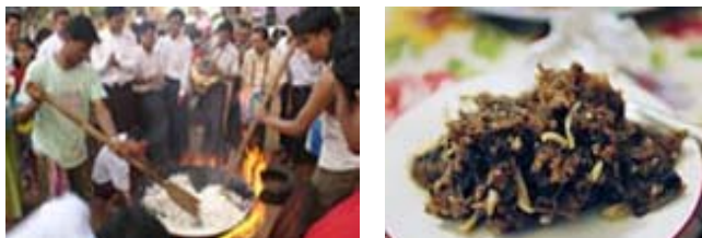
Fig. 20 Main activities of Htamane Festival in Myanmar

It is a celebration for the donation of sticky rice and sesame seeds. There is a competition between teams of men for donation of glutinous rice to the Great Lord Buddha. Lots of people enjoy watching the competition of cooking glutinous rice. After finishing the competition, glutinous rice is distributed as donation to people and followed by the prize giving ceremony for the winners.