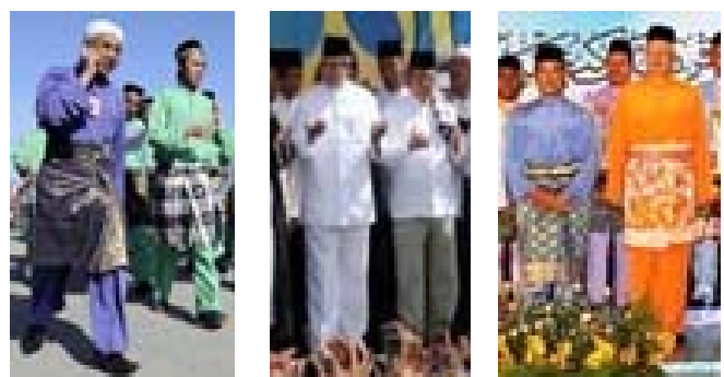
Brunei Darussalam Indonesia Malaysia

a. Muslim men in Brunei Darussalam, Indonesia and Malaysia wear stand-up collar, hip-length shirts with long sleeves; long pants; and shorts, round caps. Brunei and Indonesian Muslim men also wear short sarongs over pants.