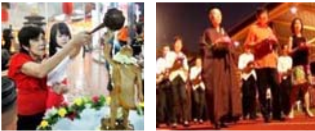
Fig. 36 Singapore Buddhist women's costumes for their religious festivals