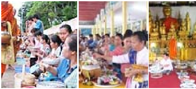
Fig. 14 Main activities of Boun Khao Salak Festival in Lao