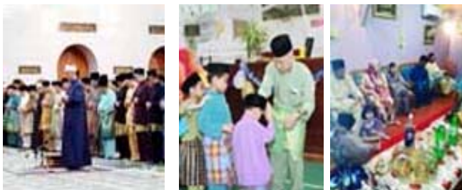
Fig. 4 Main activities of Hari Raya Aidilfitri Festival in Brunei

It is the time for celebration after the end of the fasting month of Ramadhan when prayers are held at every mosque in the country, and families get together to seek forgiveness from the elders and loved ones, and wear their traditional garb while visiting relatives and friends.