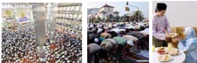
Fig. 9 Main activities of Eid ul-Fitr Festival in Indonesia

It is the celebration after the end of the Ramadhan fasting month. Indonesian Muslims gather to pray in mosques and large open areas around the country, celebrate with the traditional rice cakes, visit family and friends, donate charity, and traditional buy new cloths for celebrating this festival.