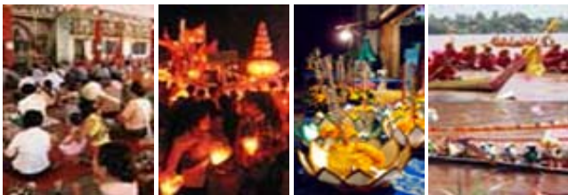
Fig. 10 Main activities of Boun Awk Pansa Festival in Laos

It is celebrated on the day of the end of Buddhist Lent: At the dawn of day, donation and offerings are made at temples around the city. In the evening, candlelight processions are held around the temples and the hundred colorful floats decorated with flower, incense and candle are set adrift down the Mekong River in thanksgiving to the river spirit. The next day, a popular and exciting boat racing competition is held on the Mekong River.