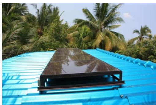
Fig. 2 Solar Panel on the roof