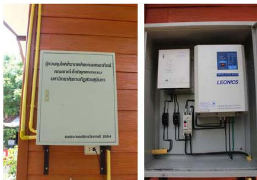
Fig. 3 Battery charge controller and AC distribution