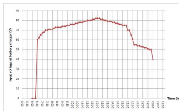
Fig. 5 Graph of Voltage from solar cell distributing to the battery charge controller

When more electrical load was added by using more fluorescence bulbs in the device, the system generated more power. Altogether, the power used received from the system was 396 \text{ W} . The DC/AC inverter would generate 3.55 \text{ A} , which was 781 \text{ VA} . When the battery was fully charged, it could generate power for 2.6 days without recharging.