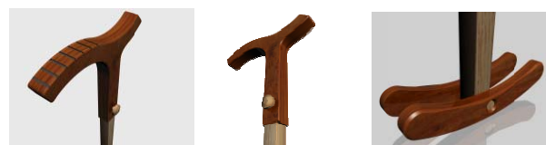
Fig. 3 The handle and the tip of the walking stick

The data from the study showed that the walking sticks for the elderly should be practical and strong to support their positioning. The design should be based on ergonomics design especially on practical handle and non-slippery. Therefore, the researcher applied the data from the elderly behavior to design the walking stick as shown in Figs. 3 and 4 below.