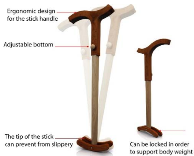
Fig. 4 Computer graphic model of the walking stick for the Elderly