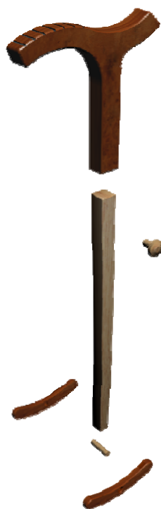
Fig. 5 Assembly of the walking stick for the Elderly