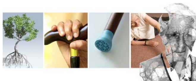
Fig. 1 Concept of the walking stick for the Elderly

Elderly are people with over 60 years old. Most of them are prone to disease, syndromes, and sickness especially on the declining of muscle strength. This physical fatigue is an obstacle in daily life activities leading to more accidents. Most accidents with the elderly are from tripping and stumbling resulting in injury to any part of their bodies due to Osteoarthritis of bones and fatigue muscles. Walking sticks can be used to prevent them from accidents because the walking sticks help support body weight, reduce force on the knee, increase more balance, and support positioning. Therefore, the researcher uses the data from the study to be a guideline to design walking stick for the elderly.