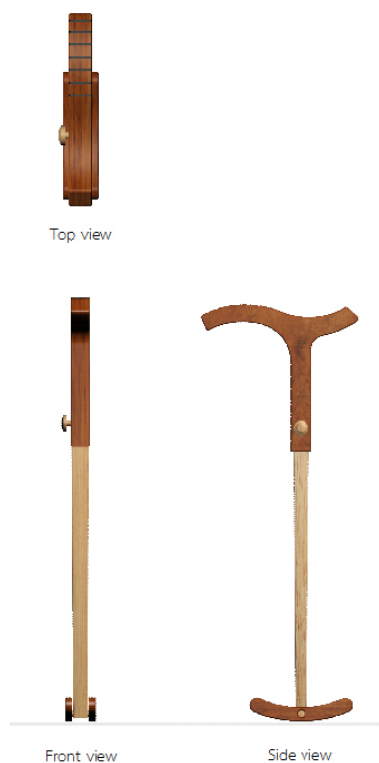
Fig. 6 Dimension of the walking stick for the Elderly