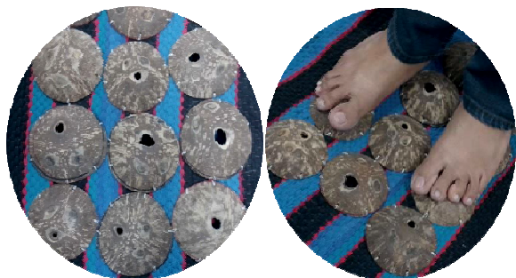
Fig. 4 The massaging tool made from coconut shells

This research is the experimental research. The duration of the research was 1 month. The sample group was a group of 58 female street vendors in Dusit, Bangkok, selected by selection criteria and voluntary. Each person in sample group was given the coconut shells massaging tool (designed and produced by the research team). The massage technique was taken from Granny Wirun's "step on the shell" massage routine [8]. Sample groups were asked to stand on the coconut shells massaging tool and massage their sole on both feet with full instruction from the researcher. The massage time was 15 minutes per each person. Data collecting tools in the research was the visual analogue scale. The research team assessed the level of exhaustion and heart rate among sample group before and after the massage, then analyzed the data by mean, standard deviation and paired sample t-test.