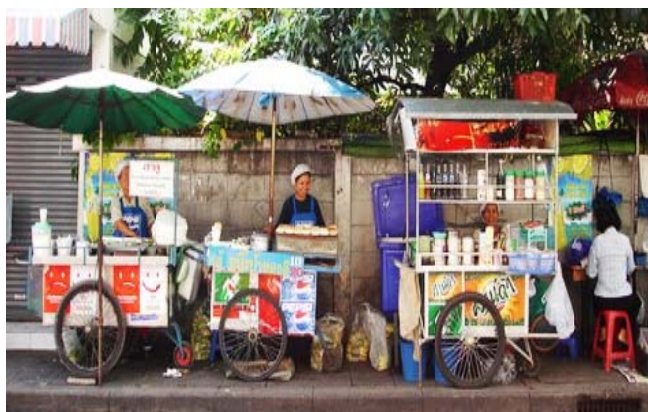
Fig. 3 The street vendors in Thewet Market

As we are concerned with the fact above, the research team decided to make a massaging tool made from coconut shells with the same method with foot reflexology. We hope that it can be an alternative way to relieve the muscle stiffness naturally and reduce chemical treatment.