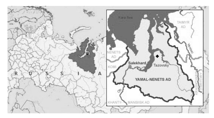
Fig. 4 Geographic location

Research area is located in the north of Western Siberia in the range permafrost zone in the central part of the Tazovskiy Peninsula. According to the geographical zoning study area is located on the territory of Nadymskiy District (Tyumen Region, Yamalo-Nenets Autonomous Area), in the west central part of the Tazovskiy Peninsula, within of spread of southern (shrub) tundra. By soil-geographical zoning [8], this area belongs to the North-Siberian (Tazovskiy) province, facies of cold permafrost Gleysol and tundra illuvial-humus Podzols of tundra, polar zone of the Eurasian region (Fig. 4).