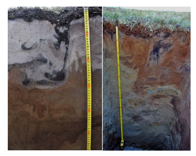
Fig. 9 Soils with illuvial accumulation of aluminum-iron-humus compounds

regime podzolization process is manifested. This process is rather weakly manifested due to weak engagement in the biological cycles of chemical elements, located in the primary minerals, despite the morphologically distinct manifestation.