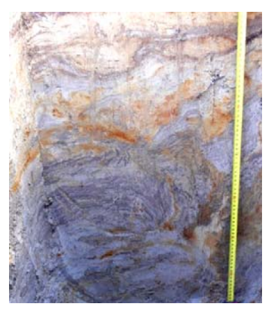
Fig. 7 Cryoturbation

As a result of uneven freezing, thixotropic mass is formed, which may flow out as a rounded spot. In general, cryogenic processes associated with the existence of permafrost, determine the nature of the modern micro-and mesorelief. Noting the role of soil-forming factors in soil formation of this territory, it should be noted that above mentioned factors are inextricably linked with each other, but the main differentiating factor is permafrost.