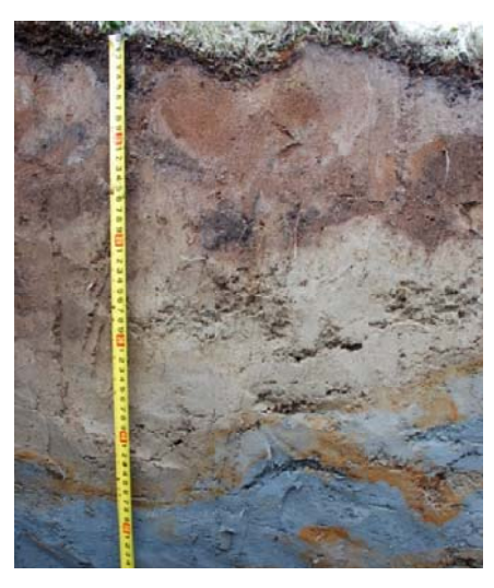
Fig. 1 Cryogenically ferruginized gleysols

The main mechanism of differentiation cryogenic of soil mass of these areas is reducing the mobilization of iron, migration to the freezing front and deposition on the oxidation barrier on the upper and lower boundaries of the gley horizon. A characteristic feature of the structure of the profile of a cryogenically ferruginized gleysols is a brightly colored in blue-gray tone gley horizon, which above and below usually has dramatically contrasting ocher border of "oxygenated gley", often having "roe" structure (Fig. 1).