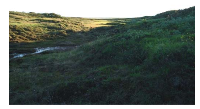
Fig. 2 Solifluction on slopes

and do not let the soil aggregates are destroyed. In the tundra, this process leads to such formative landscape and significant properties as thixotropy. As a result, the process of solifluction is widespread and strong flatness of landforms in the tundra zone is associated with solifluction (Fig. 2).