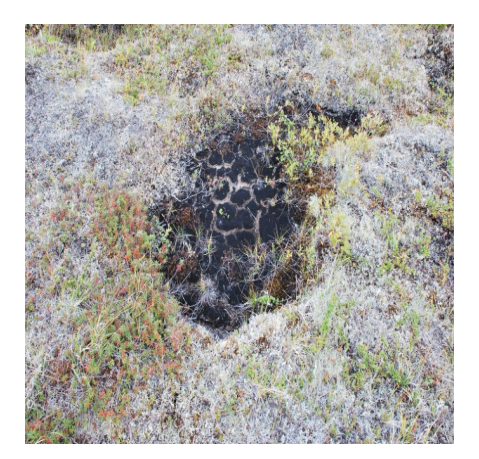
Fig. 6 The soil spot

Crack and subsequent filling of cavity soil fractions are cryogenic processes. So there is a moving of humus in the lower horizons, which means the exclusion part of the humus out of biological cycle. Crack humus material is a kind the new «body», which is subjected to zonal factors of weathering and soil formation [12].