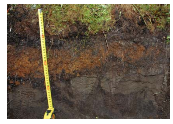
Fig. 3 Formation of peat horizon

Detritogenesis is characterized by accumulation of undecomposed and semidecomposed remains of plants and animals [7]. For considered territory, this process occurs widely due to poor intensity of transformation of plant litter, thereby mortmass is accumulated. Process factors are low temperature, overmoistening whole profile in the presence of permafrost, in view of such conditions the biological cycle is very slow. This scenario is compounded by extremely plant's ash content. Because the transformation of plant remains limited, formed peat, roughly the humus horizon (Fig. 3).