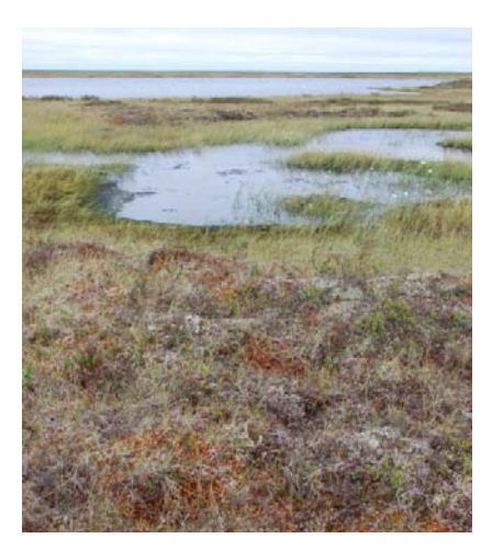
Fig. 5 Thermokarst manifestation

the influence of cryogenic and permafrost on vegetation, conditions are created for waterlogging [5].