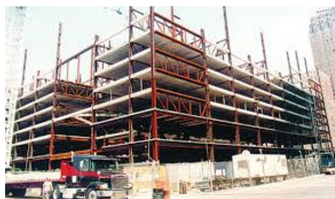
Fig. 3 Staggered truss system

In this system story-high trusses span in the transverse direction between the columns at the exterior of the building. The floor system acts as a diaphragm transferring lateral loads in the short direction to the trusses (Fig. 3) [22].