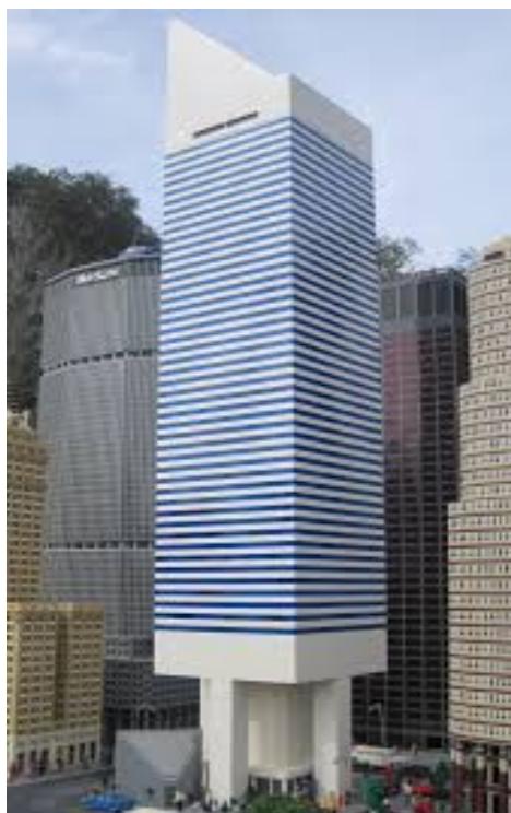
Fig. 9 Citicorp T. [22]