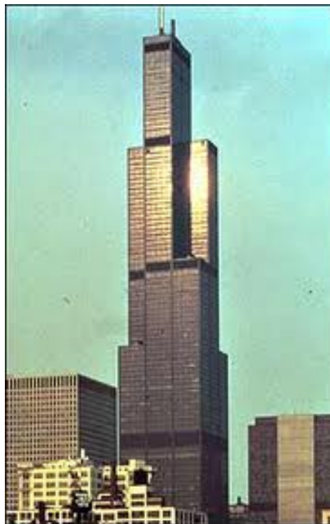
Fig. 7 Sears Tower [21]