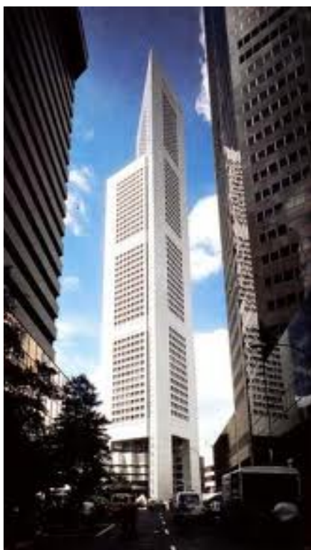
Fig. 10 Overseas Union T. [22]