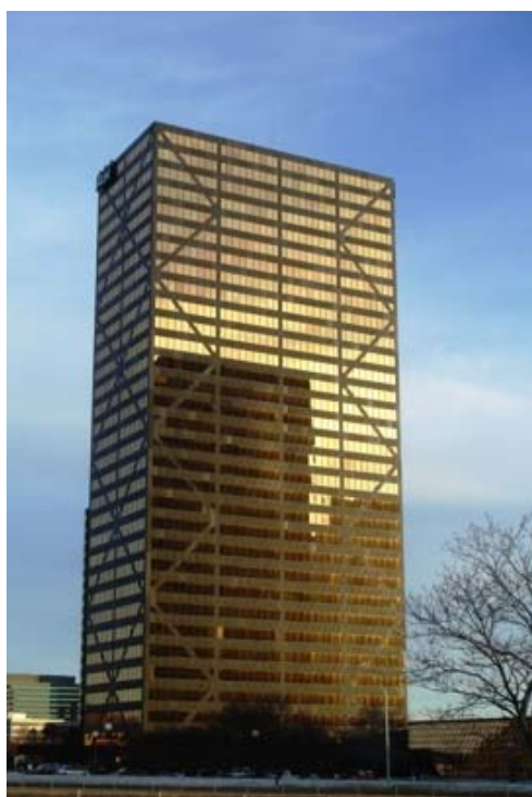
Fig. 6 Guardian B. [20]

Hybrid system gaining popularity is the concrete-filled steel tube column, where the erect ability of a steel frame is maintained, but the cost effective axial load capacity of high strength concrete used. The steel tube provides confinement to the concrete much more efficiently than normal reinforcement does, and it is on the extreme outside, where it is most effective (Figs. 9, 10) [23].