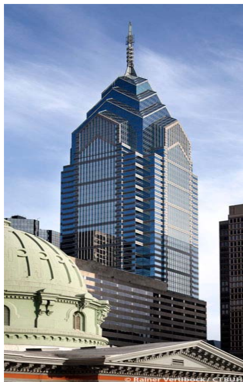
Fig. 4 One Liberty Palace [23]

The bundled tube system can be visualized as an assemblage of individual tubes resulting in multiple cell tube. The increase in stiffness is apparent. The system allows for the greatest height and the most floor area. This structural form was used in the Sears Tower in Chicago Fig. 1. In this system, introduction of the internal webs greatly reduces the shear lag in the flanges. Hence, their columns are more evenly stressed than in the single tube structure and their contribution to the lateral stiffness is greater (Fig. 7) [18].