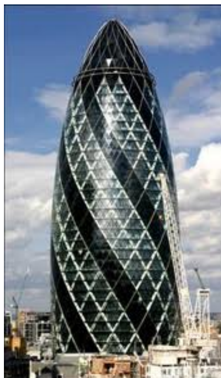
Fig. 8 Swiss re B. [22]