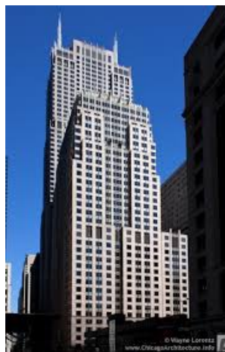
Fig. 5 AT&T Corporate Center [24]