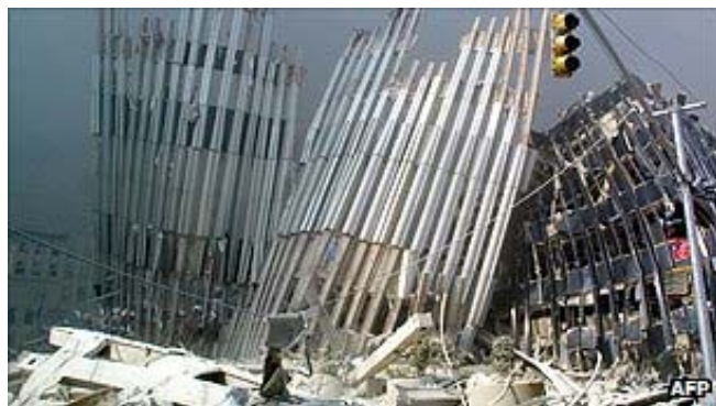
Fig. 1 A U.S. Navy assault ship built with steel from the fallen World Trade Centre

LEED program. Further, most green codes and standards recognize the excellent potential of CFS at reducing the amount of construction waste generated at a site. Most of this is due to the almost universal use of pre-engineered and assembled panels to build steel assemblies using modern, efficient technology. For example, of all the waste from a 2000 sq. ft. residence framed with steel, less than 2 % of steel is left over and can be recycled compared to that same house built of wood generating 20% of waste that will be sent to landfill [8].