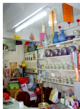
Fig. 6 Thai wooden flute under the concrete beam because the desk for cash keeping is under it