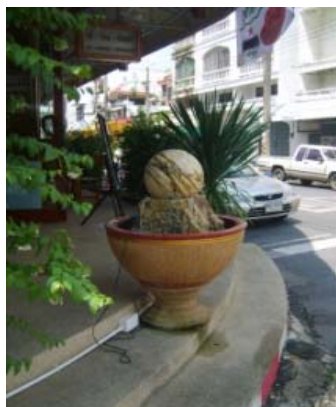
Fig. 2 The spherical piece of rock in a fountain basin