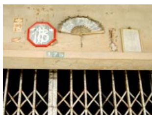
Fig. 9 The fan blowing away bad luck