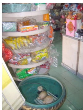
Fig. 7 Paired turtles mean husband and wife living together peacefully and eternally