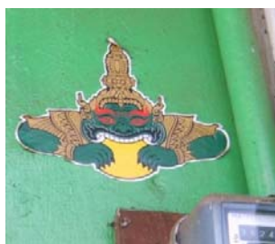
Fig. 8 The monster holding the moon in his mouth blowing away bad luck