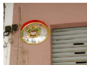
Fig. 1 The Chinese style lion holding a sword in his mouth painted on a mirror

It is sometimes unavoidable for shops to be located in inappropriate location including areas at crossroads/junction, directly opposite a road/lane/alley, or a building such as shrine, temple, bank, big building, flyover, hill or mountain, forest, open land or other undesirable places or objects like electricity poles, transformers, unorderedly electricity wires, post-box, telephone booth, drain lid, etc. This is especially true with rented or bought out shops. Hence, they need to acquire some auspicious materials to counter the possible bad effects, either by themselves or suggestions from Chinese fortune tellers. These auspicious materials can be the picture of a Chinese style lion holding a sword in his mouth painted on a mirror (Fig. 1), a spherical piece of rock in a fountain basin (Fig. 2) or a wind turbine (Fig. 3), etc.