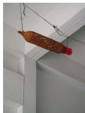
Fig. 5 The Thai fish trap is hung up because the desk for cash keeping is under the concrete beam