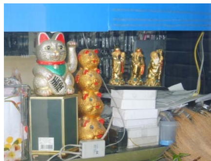
Fig. 4 The cat beckoning for fortune and bring in richness