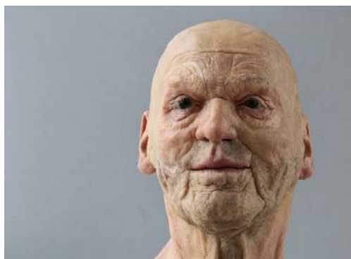
Fig. 2 Damaged facial skull replaced by RP model