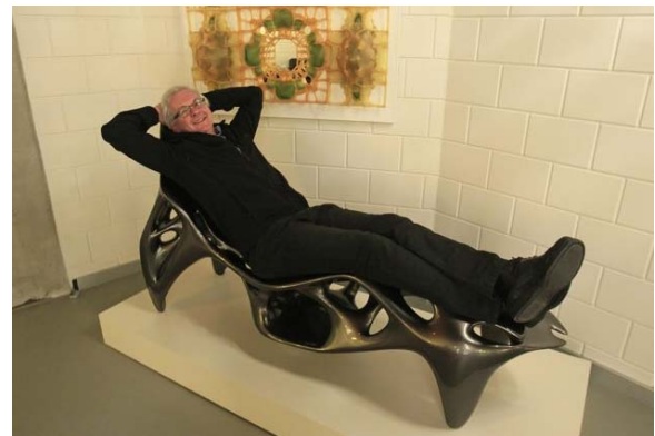
Fig. 6 RP model of furniture

The furniture is designed and manufacturing with a aid of RP techniques. This model has low weight and no temporary and permanent joints. It is made up of a single piece without any joints with different profiles. Fig. 6 shows the furniture model developed in the RP technique.