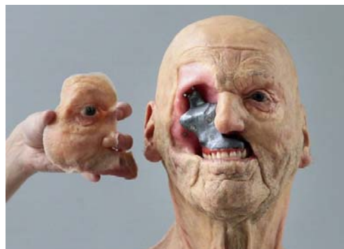
Fig. 1 Human damaged facial skull

The RP model plays the vital role in medical applications. It is used in human facial skull transparency in the medical field. Fig. 1 shows the damaged portion of the human facial skull. Fig. 2 shows the damaged portion of the facial skull has been replaced by the RP model.