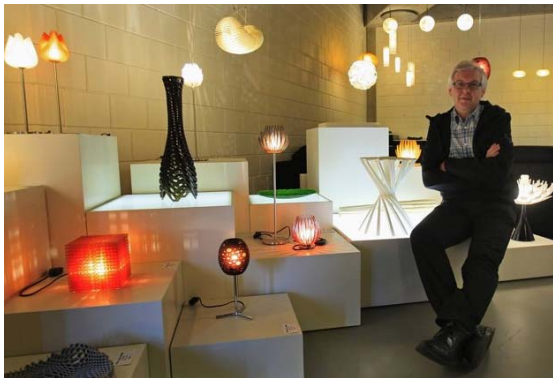
Fig. 4 RP model of an electrical appliances

The house holding electrical appliances are widely manufactured in the RP techniques. These RP techniques are very useful for manufacturing the special contours in an electrical item. Fig. 4 shows the RP models of electrical appliances.