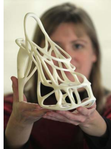
Fig. 5 RP model of foot-ware