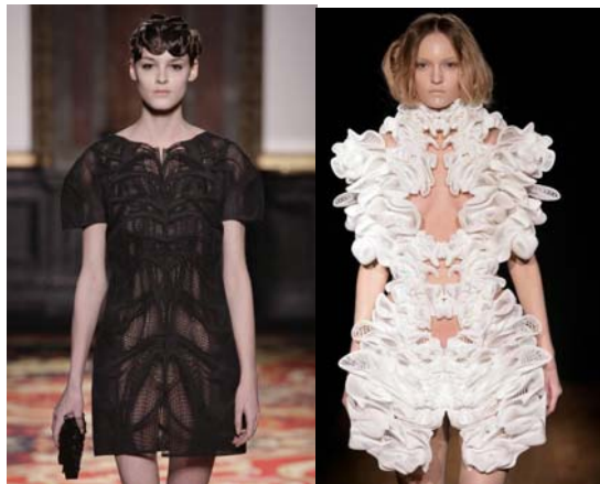
Fig. 3 RP model of dresses with special contours