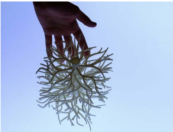
Fig. 8 (b) RP model of special objects (Tree stems)