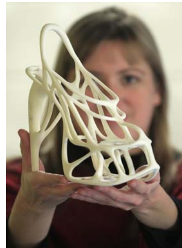
Fig. 5 RP model of foot-ware