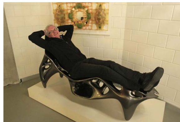
Fig. 6 RP model of furniture

The furniture is designed and manufacturing with a aid of RP techniques. This model has low weight and no temporary and permanent joints. It is made up of a single piece without any joints with different profiles. Fig. 6 shows the furniture model developed in the RP technique.