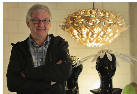
Fig. 7 RP models of an architectural interior design

An RP technique plays an important role in architectural interior design like stature, wall mountings and toys. The RP model of interior decoration has good surface finishing and aesthetics compared with convention models. Fig. 7 shows RP models of an architectural interior design.