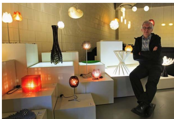
Fig. 4 RP model of an electrical appliances

The house holding electrical appliances are widely manufactured in the RP techniques. These RP techniques are very useful for manufacturing the special contours in an electrical item. Fig. 4 shows the RP models of electrical appliances.