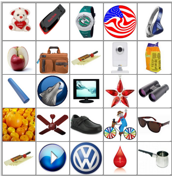
Fig. 1 Image-set for registration