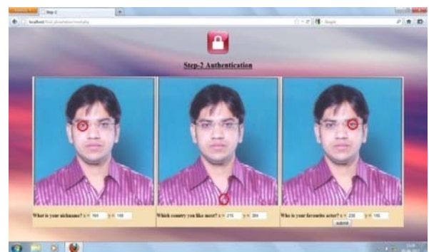
Fig. 3 Step-2 Authentication