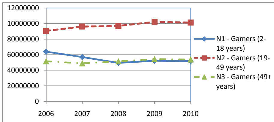
Fig. 1 Age-structured Game Playing Population