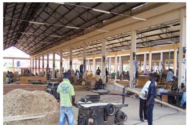
Fig. 1 Wood workers at the SWV, Kumasi

Geographically, the SWV is located in the Nhyeaso Sub-Metropolitan Area of the Kumasi Metropolis (see Fig. 2). This ultra-modern wood village occupies about 12 hectares and was designed to accommodate about 4,790 workers engaged in wood related SMEs. The construction of the facility was jointly funded by the French and Ghanaian governments at a cost of about US$10 million [17], [18]. The objective of SWV development was to enhance the productivity, the working and the living conditions of the wood workers [18]. Available facilities and services in the SWV include electricity, pipe borne water, toilet facilities, road networks, a health post, a security post, a bank and an insurance firm.