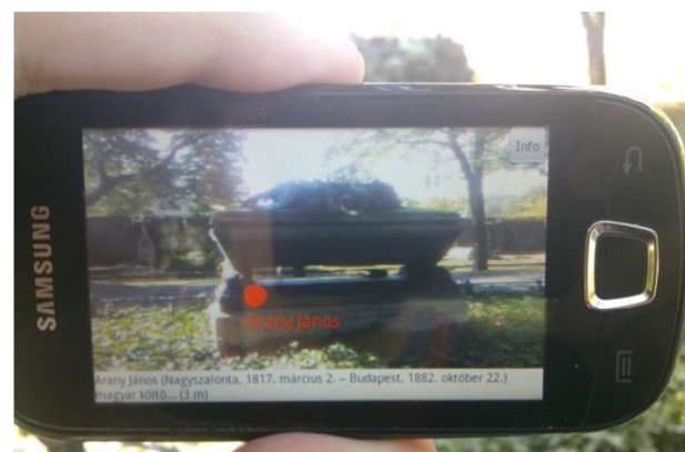
Fig. 4 Augmented Reality-based navigation

The other visualization solution is based on the Augmented Reality. Currently, several Augmented Reality engine already available, but we decided to implement an own module. The reason was that the existing Augmented Reality engines are typically complex, resource-intensive as well as difficult to use. Accordingly, we have implemented an own Augmented Reality module, which based on the mathematical model described in [21]. This module is easy to use and with the help of it is simple to implement location-based Augmented Reality applications. Once the user navigated the nearest junction of the selected tomb by using the map view, the Augmented Reality-based navigation allows him to get to the final destination. The user could see the distance between the current position and the selected tomb via the camera of smartphone. The right direction towards its final destination is displayed as well. Fig. 4 illustrates an example of the operation of this module.