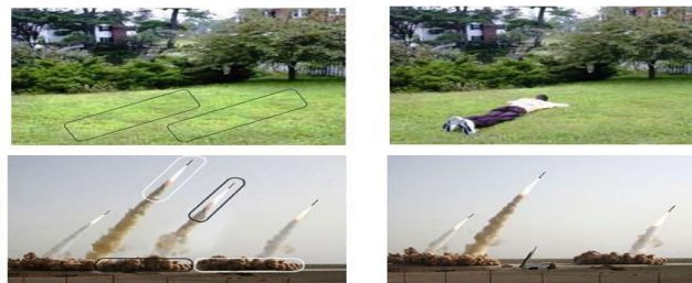
Fig. 1 Examples of CMIF. Forged images are in left column and original images are in right column. Rows depict object removal (above) and object duplication (below)

The forged images are shown in the left column and the original images are shown in the right column. The top row depicts object removal and the bottom row shows object duplication in an image attacked by CMIF.