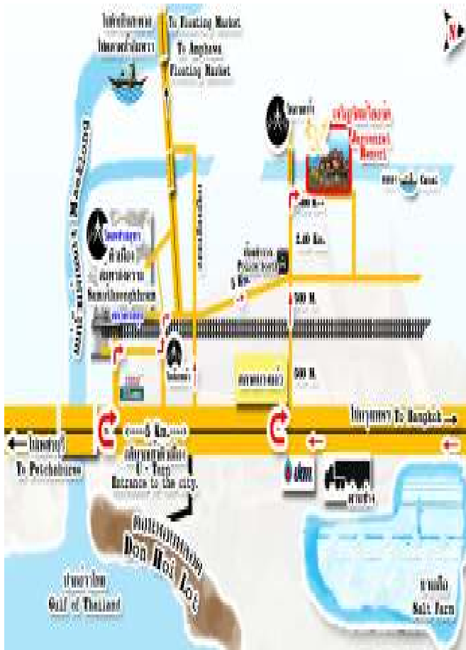
Fig. 1 Map of Samut Songkram