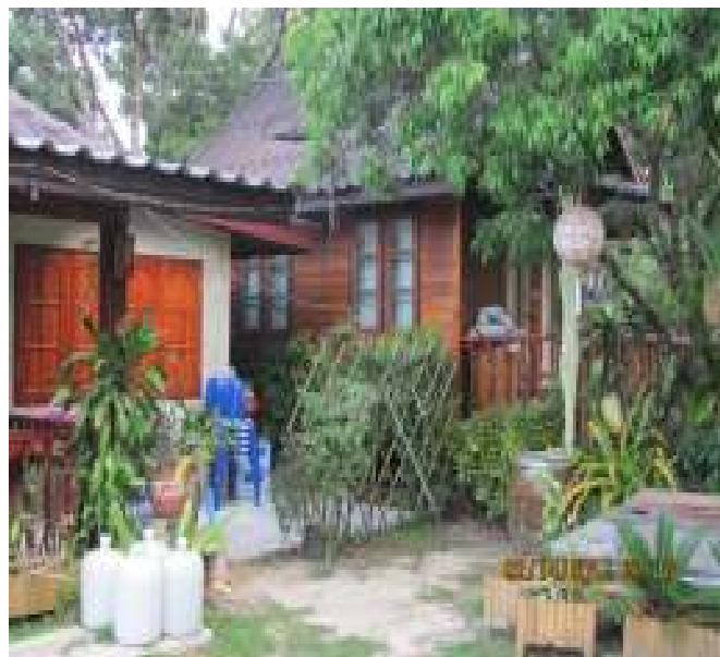
Fig. 5 Hospitality Business in Bang Khonthi