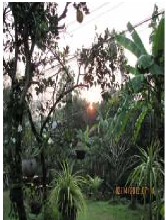
Fig. 4 Agriculture Area