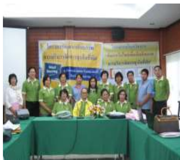
Fig. 7 Ruk Bang Khonti group

We have suggestions in two main aspects which are a policy and a suggestion for the entrepreneur of the residential in Samut Songkhram. A suggestion regarding the policy for Bang Khonthi district including a whole province of Samut Songkhram is that there must be a sponsor for an ecotourism which emphasizes on arts, culture, and the color of way of life. Also, the nature must be preserved by raising more awareness of tourists towards its importance to all lives on earth. The local people should be encouraged to form a network such as Ruk Bang Khonti group which lets them share opinion and help one another. Eventually, this will lead to a learning process and an experience accumulation. In order to develop the tourism in this particular area, the policy should not be done hurriedly or comparing with others. The main goal is to let everybody involve and thoroughly have them experience the most out of this development. Hence, it can be said that living in accordance with the philosophy of sustainable economy is one approach leading to a real strong community as people are always reminded of a cautious life.