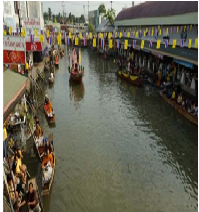
Fig. 3 Morning Culture Buddhist Style