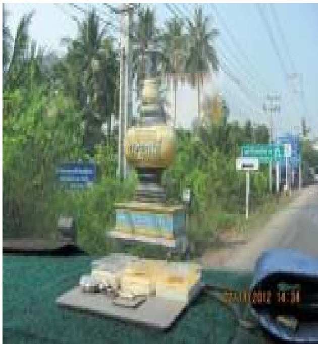
Fig. 2 Environment in Bang Khonthi