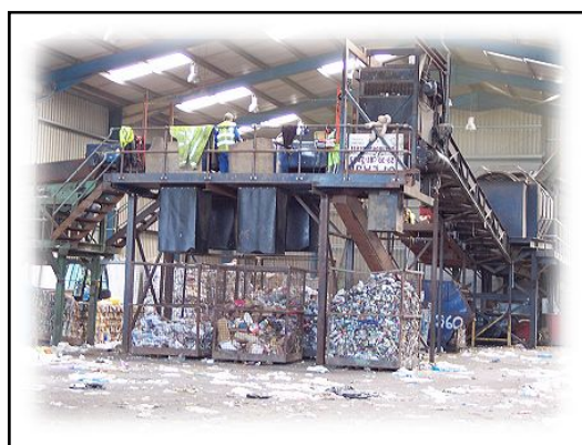
Fig. 3 Bales of crushed plastics ready for transport to the process