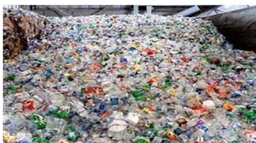
Fig. 2 Bales of crushed plastics ready for transport to the smelter