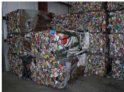
Fig. 1 Bales of crushed steel ready for transport to the smelter

recycling [6], Levels of metals recycling are generally low. In 2010, the International Resource Panel, hosted by the United Nations Environment Programme (UNEP) published reports on metal stocks that exist within society [7] and their recycling rates [8].