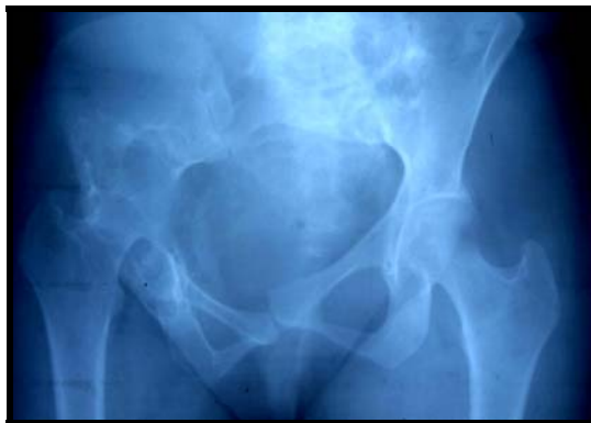
Fig. 5 Case No. 4: Hip and Pelvis Involvement