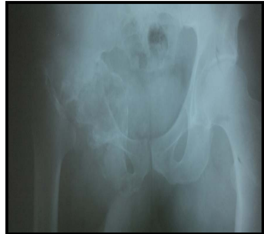
Fig. 3 Case No. 2: Long Bone Involvement (Left Humerus)