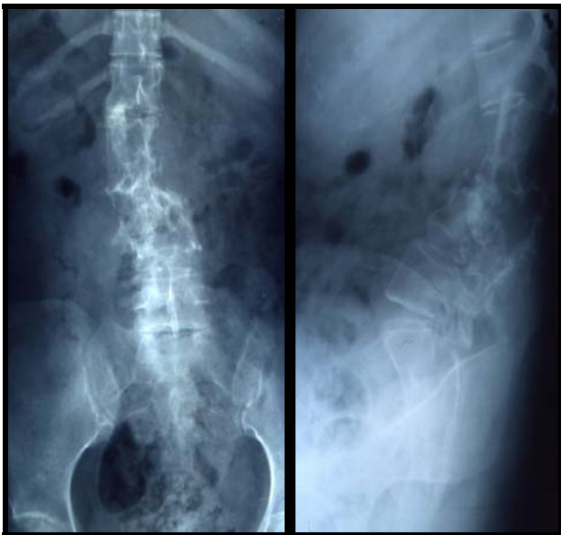
Fig. 2 Case No. 1: Spine Involvement