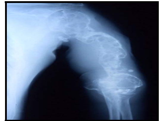
Fig. 4 Case No. 3: Hip and Pelvis Involvement