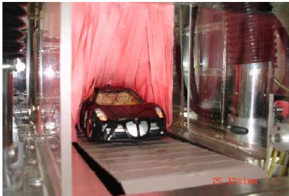
Fig. 3 Washing