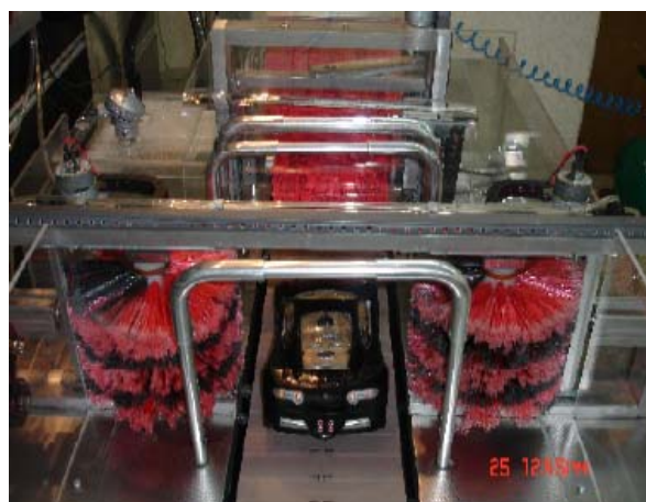
Fig. 2 Sampling of vehicle dimensions

The geometry sampling of vehicle by metering sensors is carried out and data is sent to I/O function unit with two decimal places (Fig. 2). PLC uses these dates to adjust functional program of the device.