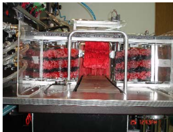
Fig. 1 Stepper motor control

The function of motor can be controlled by PLC according to the number and frequency of pulses and these factors changes. Of course this requires the implementation of specific programs, but for better performance, a special module for stepper motor control in three Forward, Backward and off is designed which is programmable on the base of motor type and can be changed and adjusted easily.