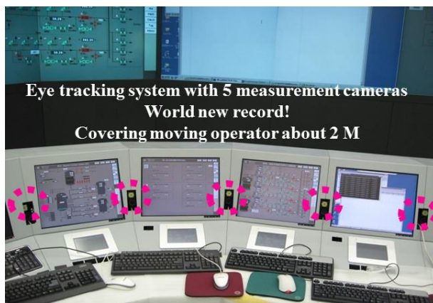
Fig. 2 Five-camera Eye Tracking System (ETS) installed in HUEPSS

representing the plant state (e.g., process parameters and alarms) and control activities performed by operators. Process parameters are observed and evaluated to see how well the plant system is operated. Design faults or shortcomings may require unnecessary work or an inappropriate manner of operation, even though plant performance is maintained within acceptable ranges. This problem is solved by analyzing plant performance (or process parameters) with operator activities. Inappropriate or unnecessary activities performed by operators are compared with logging data representing the plant state if operator activity is time-tagged. This analysis provides diagnostic information on operator activities. For example, if operators should navigate the workstation or move around in a scrambled way in order to operate the plant system within acceptable ranges, the HMI design of the ACR is considered inappropriate. As a result, some revisions are followed, even though the plant performance is maintained within acceptable ranges. An eye tracking system equipped with five measurement cameras records eye movement of a moving operator on a wheeled chair, as shown in Fig. 2 and provides data for evaluation of situation awareness, cognitive workload and personnel task. Eye-tracking measures for evaluations of situation awareness and cognitive workload are connected to personnel task performance with time-tagged information.