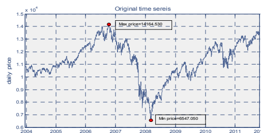
Fig. 1 Time series plot of DJIA30

Fig. 1 shows the stock market index behavior over the time and we can see the data are not stationary and it appear that (DJIA30) rise to the peak in the end of 2007, but steep down to lowest point in the beginning of 2009.