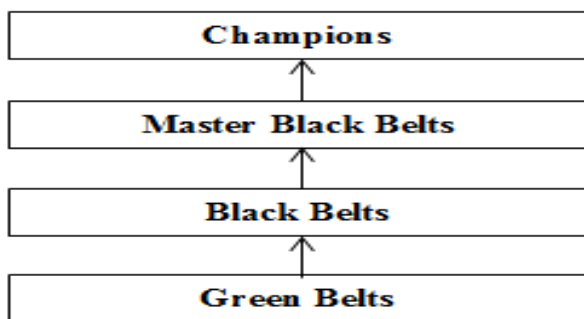
Fig. 2 The stages of Six Sigma [18]