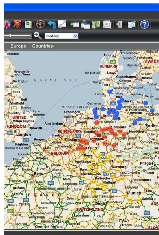
Fig. 3 Prototypical implementation