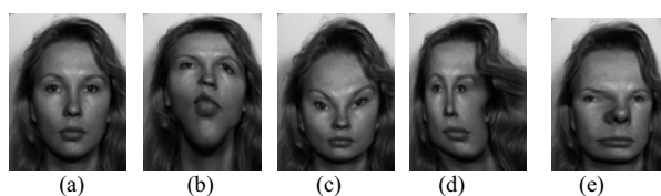
Fig. 6. Image warping: (a) source (b)-(e) warped images.

The warping method discussed in section III E can be used independently to freely deform images using all, one or any combination of the control points. During warping the source and target images are the same. Also, no intermediate images are produced, as is the case with morphing. Fig. 6 shows some of the images produced by the warping function.