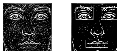
Fig. 2. Left: Edge detection results for the 7x7 laplacian of gaussian filter. Right: Edge detection results for the 7x7 laplacian of gaussian filter and the 3x3 medium filter

The filters are used to conform and reinforce these positions. The filters are applied only inside the face regions detected by the FDNN. The first filter applied is the Laplacian of Gaussian, to smooth and detect the edges of the facial features. A large kernel (e.g. 15x15) used with this filter produces very good edge detection but the computation time rises exponential with the size of the kernel. After several experiments, a trade-off kernel of 7x7 was employed. Fig. 2 shows the results of this filter using a 7x7 kernel. All the edges are extracted as shown.