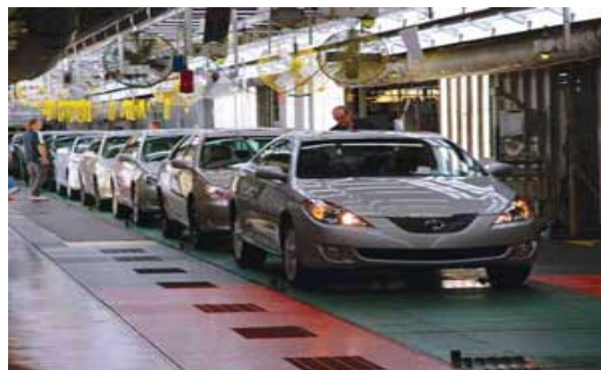
Fig 1 Showing a Lean Manufacturing Assembly Line at one of the Toyota plants

Authors are with Department of school of Engineering, University of Portsmouth Anglesea Road, Portsmouth PO1 3DJ, United Kingdom (email: Said.Azzam@port.ac.uk, laura.arias@myport.ac.uk, Shikun.Zhou@port.ac.uk)