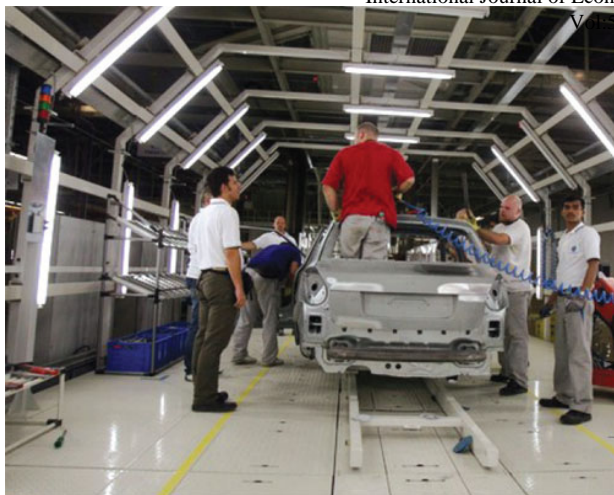
Fig 2 Shop Floor Management in action at Toyota