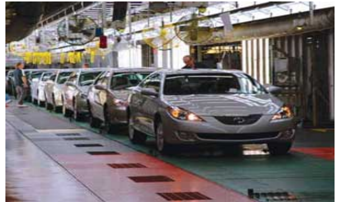
Fig 1 Showing a Lean Manufacturing Assembly Line at one of the Toyota plants