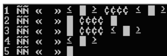
Fig. 7 Template converted to extended ASCII character

The program view of the template "conditioncode4" is illustrated in Figure 7. This figure shows the knowledge base before the programming code has been added to its template.