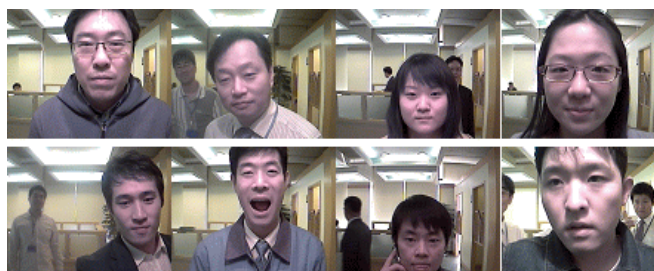
Fig. 3 Some face images of the testing domestic face database

The testing domestic face database consists of 837 images of 75 persons with no restriction on illumination, pose, and facial expression. 53 of 75 persons overlap with the persons of the training face database, and the other 22 persons are totally new. Each image is JPEG with a resolution of 640 \times 480 . Some face images of the testing domestic face database are shown in Fig. 3.