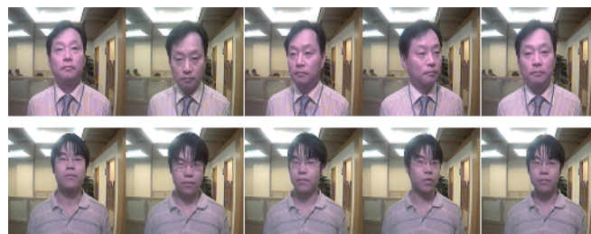
Fig. 2 Some face images of the training domestic face database

The training domestic face database consists of 415 images of 83 persons with 5 pose directions ( -45^\circ , -22.5^\circ , 0^\circ , +22.5^\circ , +45^\circ ) under different illuminations. Each image is JPEG with a resolution of 640 \times 480 . Some face images of the training domestic face database are shown in Fig. 2.