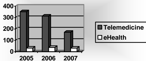
Usage Everywhere in the Text