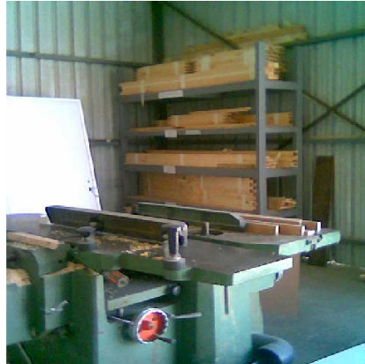
Fig. 5 5S application to woodworks area

In 5S application to the defined 10 areas at Prefab facility, it was necessary to develop a 5S checklist based on the 5S practical guide discussed earlier. The check list helps identifying opportunities and techniques for 5S successful and comprehensive application.