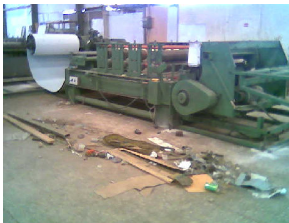
Fig. 2 Examples of waste and on-floor inventory