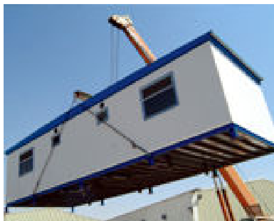
Fig. 1 Sample prefab product

This project is aimed at analyzing the workflow and improving workstations at a Prefab factory in Amman. The facility produces prefabricated structures such as portable buildings, homes, offices, and communication shelters. Figure 1 shows an example of the facility prefabricated products.