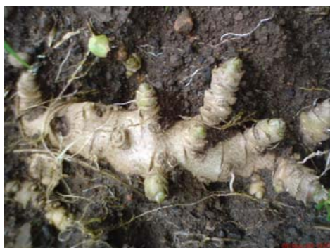
Fig 2. Rhizome of binahong

Classification of plants binahong as follows: 1) Kingdom: Plantae (plants), 2) Subkingdom: Tracheobionta (vascular), 3) Superdivisio: Spermatophyta (produce seed), 4) Divisio: Magnoliophyta (Flowering), 5) Class: Magnoliopsida (dashed two / dicots), 6) Sub-class: Hamamelidae, 7) Order: Caryophyllales, 8) Familia: Basellaceae, 9) Genus: Anredera, 10) Species: cordifolia Anredera (Ten.) Steenis [5]. The results of phytochemical binahong with test tubes in getting the chemical content is flavonoids, saponins and alkaloid[14]. Binahong plants have a total flavonoid content of 0.6 mg per 100 grams of dried root powder[6].