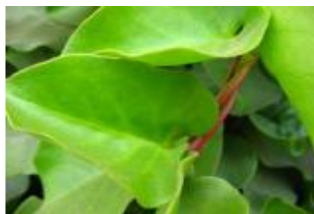
Fig. 1. Leave of Binahong

Binahong plants located in Indonesia, China, Australia, Paraguay to southern Brazil, northern Argentina and the United States. Binahong Latin name is Anredera cordifolia (Ten.) Steenis, synonyms Boussingaultia cordifolia (Ten.) Boussingaultia gracilis , Boussingaultia Pseudobasselloides Haum [3], while the other equation is anredera country name, enredadera del mosquito (Spanish), filikafa , Gulf madeiravine , heartleaf madeiravine , Madeira vine (UK), lamb's tails , mignonette vine , Parra de Madeira (Spanish), tapau , 'uala hupe , teng san chi (China) [3,4]. This plant grows easily in the lowlands and highlands. Widely planted in pots as an ornamental and medicinal plants. Generative (seed), but more often developed or cultivated vegetatively through rhizome roots.