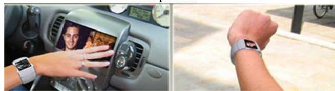
Fig. 7: Concept C usage scenario

movies presenting the new concept shoot and a new evaluation of the device acceptance made.