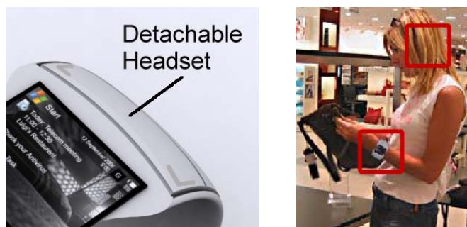
Fig. 9: the integrated/detachable headset

Thinking this new concept we had also to take into account what was a third key requirement of the users that is not making your communication patterns more complicated with the introduction of two items instead of one. We had so to think about a concept that integrated the headset in the wrist phone, detachable when necessary (i.e. incoming calls) but part of it and not requiring a separate recharge manner (fig.9).