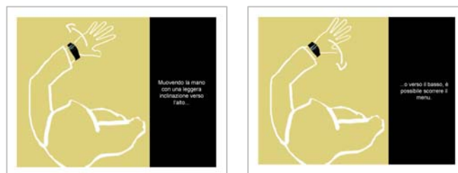
Fig. 5: scrolling through wrist rotation

Moving the hand with a slight tilt upward or downward, the user can scroll through the vertical menus (fig.5).