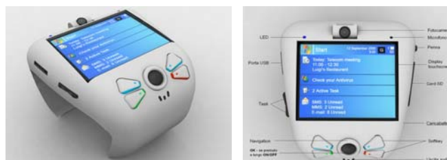
Fig. 1: Concept A