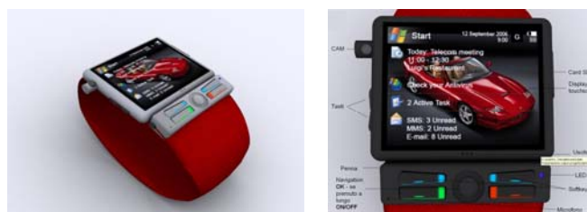
Fig. 2: Concept B

The definition of these prototypes has allowed us, through the 3D modeling, to see how certain technological requirements for this project could have been translated into reality, but especially provided us with material for a first round of device acceptance with the target users, in order to enter into the users co-design phase.