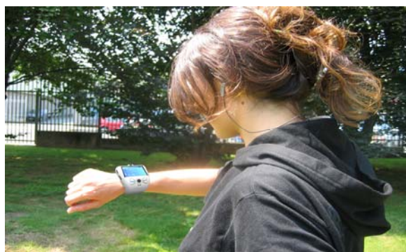
Fig. 4: Concept A usage scenario

To get the material to be submitted to the users, specific scenarios have been built for each Persona. Scenarios are essentially stories about the characters and what they do in their daily life [5] having a plot that marks actions and events. They can encourage reflection during the process of design but especially are very flexible and can be quickly revised according to change in design needs [4]. The Personas, which are used as round characters within them, may focus the attention of the designer on the desires and needs rather than on the mere actions, helping in the designing of future services where there are no specific "a priori" requirements defined [18, 19].