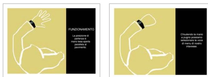
Fig. 6: click/selection through hand closure

To confirm the selection of a menu option the user has just to close the hand starting from an initial position with the open hand so selecting the preferred item (fig.6).