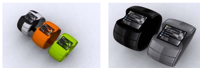
Fig. 8: different personalization of Concept C

Thinking this new concept we had also to take into account what was a third key requirement of the users that is not making your communication patterns more complicated with the introduction of two items instead of one. We had so to think about a concept that integrated the headset in the wrist phone, detachable when necessary (i.e. incoming calls) but part of it and not requiring a separate recharge manner (fig.9).