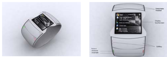
Fig. 7: Concept C