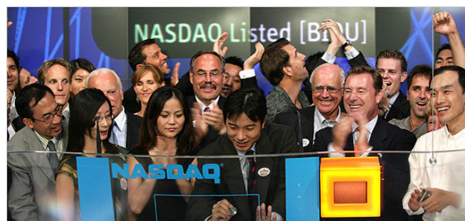
Fig. 5 IPO victory of Baidu

Financially, Baidu took the road from venture capital (VC) firms to initial public offering (IPO). In 2001, the company raised $1.2 million from VC firm financing, and another $10 million from four VC companies led by Draper Fisher Jurvetson and International Data Group. In 2004, Baidu acquired Hao123.com, a popular Chinese Web directory, then 25th at Alexa.com's global Internet traffic ranking. In March 2005, Baidu began its preparation to go public, and finally in August, it achieved IPO victory in the United States (see Fig. 5), opening at $66 and closing at $120 per share [2].