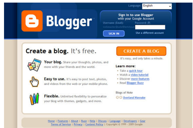
Fig. 4 Google Blogger (adopted from webhostingsecretrevealed.com)

One of Google's earliest ventures into social networking is the social networking and blogging site Blogger.com, acquired by the company in 2002. Blogger.com (Fig. 2) was one of the earliest social networking sites, having been established in 1999 as a small social network site. Blogger.com's corporate policies remain adherent to the ideals of openness and availability of content that is often expressed in Web 2.0 definitions. Limitations on content are restricted only to the legally required minimum, and copyrights are explicitly assigned to the writer in order to encourage content creation and sharing.