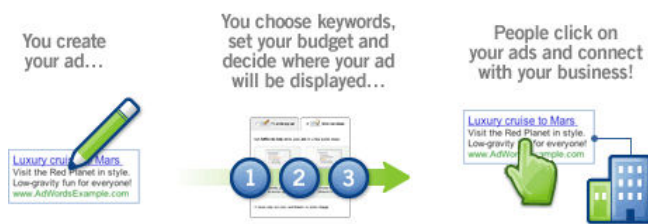
Fig. 2 AdWords (adopted from adwords.google.com.au)

No other EC company can match the success of Google and its meteoric rise. Google is considered by many to be not only changing the Internet but also the world. Google uses several varieties of search engine advertising methods that are generating billions of dollars in revenue and profits. The major methods are AdWords (Fig. 2) and AdSense (Fig. 3)