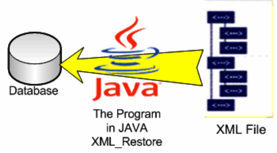
Fig. 4 The database restoration process

The Principle : Here starts the XML file which has been created from the database. This base is crossed by the JAVA program which extracts the data from it to restore them in the database.