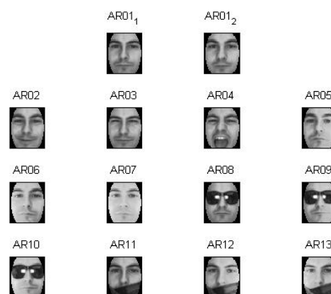
Fig. 2 Example of one individual from the AR face database: (1) neutral, (2) smile, (3) anger, (4) scream, (5) left light on, (6) right light on, (7) both lights on, (8) sunglasses, (9, 10) sunglasses left/right light, (11) scarf, (12, 13) scarf left/right light

As in [11], we used as training images two neutral poses of each person captured in different days (labeled AR0 1 and AR0 2 ), while the testing set consists of pairs of images for the remaining 12 conditions, AR0 2 ...AR1 3 , respectively. More specifically, images AR0 2 , 0 3 , and 0 4 are used for testing the performances of the analyzed techniques to deal with expression variation (smile, anger, and scream), images AR0 5 , 0 6 , and 0 7 are used for illumination variability, and the rest of the images are related to occlusion (eyeglasses and scarf), with variable illumination conditions.