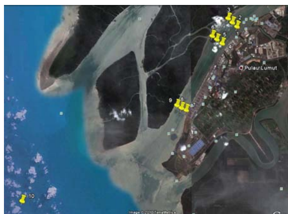
Fig. 1 Location of the sampling stations in West Port Malaysia

West Port is one of the Malaysia's principal gateway and busiest port with 22 berths. West port has been developed along the Klang strait and it is well sheltered by surrounding mangrove Islands. In this project, study area is restricted to narrow corridor between Klang Island and Che Mat Zin Island on the west of the Indah Island, 10 points are defined in this project "Fig. 1". The study area lies within humid tropical part with rainy season (North monsoon, November to March) and dry season [4]