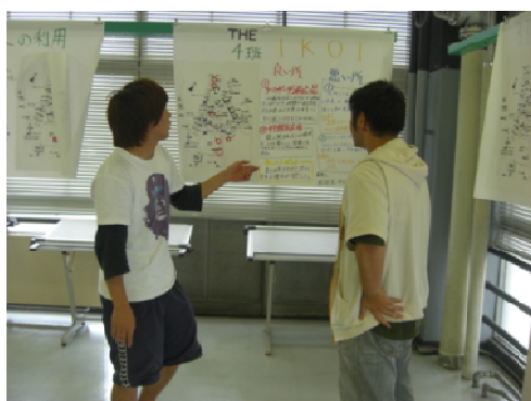
Fig. 5 The scene of their presentation