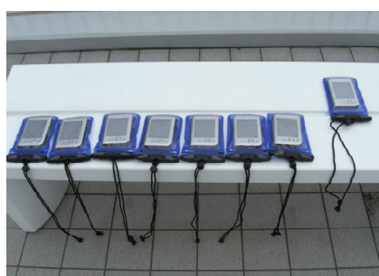
Fig. 1 PDAs used in our class