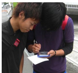
Fig. 3 Campus fieldwork Fig. 4 The scene of operating PDA