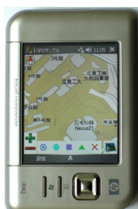
Fig. 2 Campus map