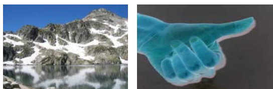
Fig 1. Two images from CLIC. Left: an original image from the kernel ("Mountain" class); right: a transformed image (negative transformation) in the testbed