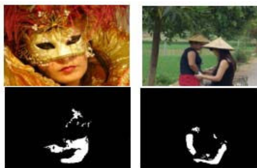
Fig 3. Skin detection for two images of the category "People".

We use images from the category "Society" composed of images with people. The algorithm uses 5 conditions applied on R,G,B (normalized) components [10].