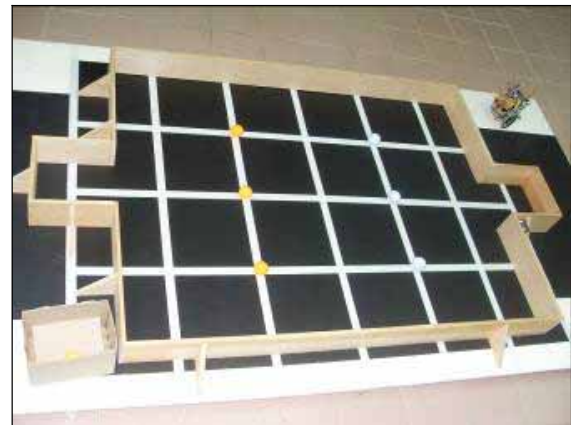
Fig. 1 Robot soccer competition field

The rules of the robot soccer competition are as below: