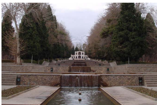
Fig. 2 Main elevation of Shah Zadeh garden, Mahan-Kerman