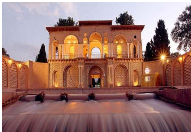
Fig. 1 Main Entrance of Shah Zadeh garden, Mahan-Kerman

Shahzadeh Garden is located at a point 35 km from south-eastern Kerman, and at a point 6 km from Mahan, on the Kerman-Bam Road near the altitudes of Joupar. It is an Iranian garden benefiting from the best natural situation. Shahzadeh garden, Mahan has been constructed in Ghajar Era, at 11-year old sovereignty of Abdolhamic Mirza Naseroldoleh. This garden is located near the tomb of Shah Nematollah Vali on the hillsides of Joupar altitudes. Fertile soil, sufficient sunshine, mild wind, and access to Tigran water had made it possible to construct a garden on that scale on an arid and barren land. Shahzadeh Garden is located on Joupar altitudes in an area of 5.5 hectares, in a rectangular form and slope of about 6.4%. A long fence separates it from the undesirable atmosphere of its peripherals.