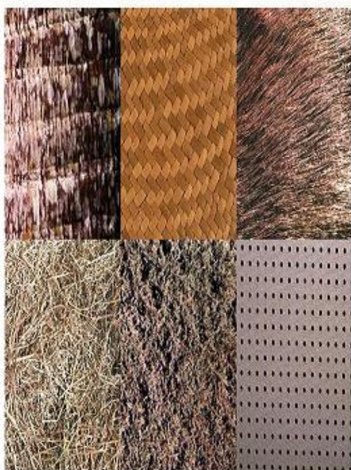
Fig. 1. Images of the VisTex database (left-right, up-down): Bark0, Fabric0, Fabric4, Grass1, Leaves12, Tile7