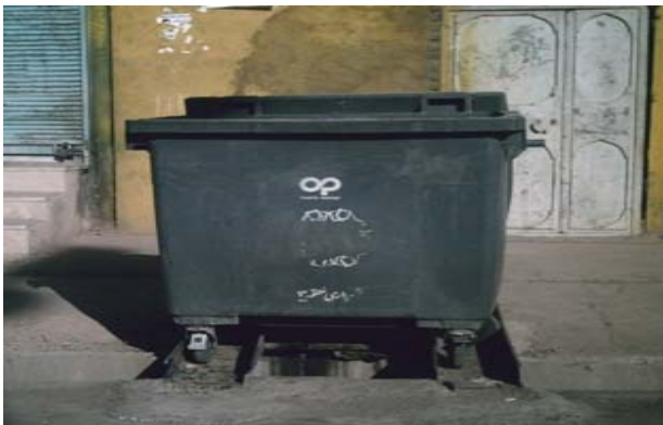
Fig. 4 Type of mechanical container for MSW collection in main streets and commercial areas, Khoram Abad

Like many other developing countries, scavenging plays a role in reducing the quantity of waste reaching the disposal site. Although scavenging activities reduce waste volume, they make waste collection much more difficult due to the opening of garbage bags. The valuable components of MSW, such as papers, plastics (PET, PP, PE, etc.), glass, metals and breads are collected by some people irregularly in the city, as well as at the disposal site. They sell the recovered materials to small recycling units.