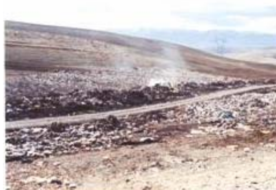
Fig. 8 Wastes disposal around the road and waste burning in landfill site

Some obvious problems of this site are as follows: