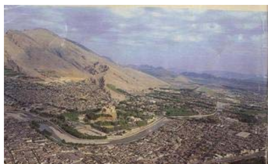
Fig. 2 A view of Khoram Abad city