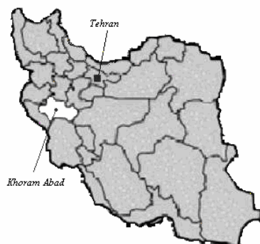
Fig. 1 The location of Lorestan province and Khoram Abad city in Iran

Khoram Abad has a main municipality that is responsible for all aspects of solid waste management.