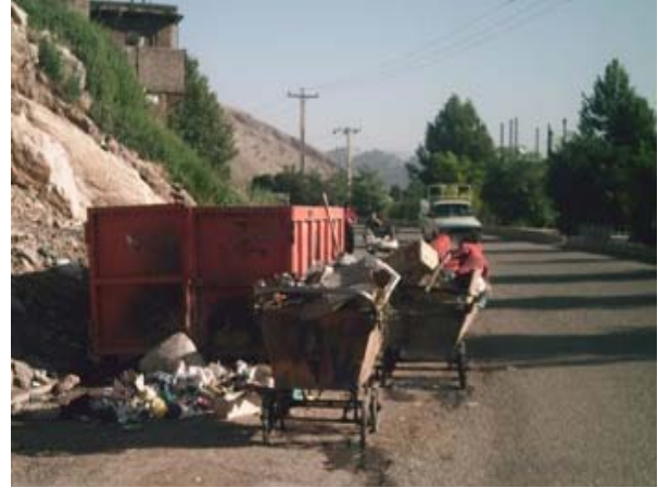
Fig. 5 Temporary terminal for collection solid waste

Local Authority (KhoramAbad Municipality) is responsible for waste collection, transportation and street sweeping. Municipality is responsible for waste collection, using private sector contracts.