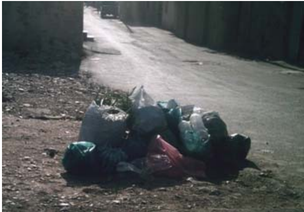
Fig. 3 Using plastic bags for transferring MSW in Khoram Abad