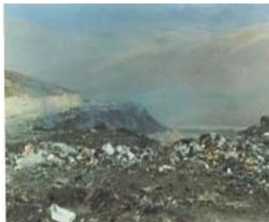
Fig. 7 View of uncontrolled dumping of wastes in landfill site

Unfortunately, at the site, some people collect valuable components of MSW informally. In addition, different types of animals such as dogs and cows consume organic components of the waste. Such inadequate disposal practices lead to problems that impair human and animal health (Figs. 7, 8).