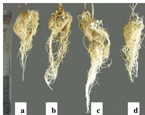
Fig. 3 Treatment of B. japonicum inoculation on the growth of Anjasmoro soybean roots at 35 DAP on Leonard bottle under greenhouse condition. (a) Control (without inoculation), (b) USDA 110, (c) BJ 11 (wt), and (d) BJ 11 (19)

The concentration of IAA on nodules was significantly different with control (Table IV), except on the treatment using Tanggamus soybean (Table IVb). This is presumably due to the complexity of the IAA influence on plant growth. The number of enzymes produced by microbes plays a role in activating of the IAA production, while other enzymes can inhibit its production [12].