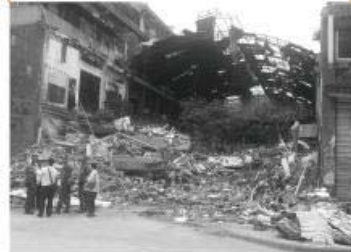
Photograph2. Inappropriate Action