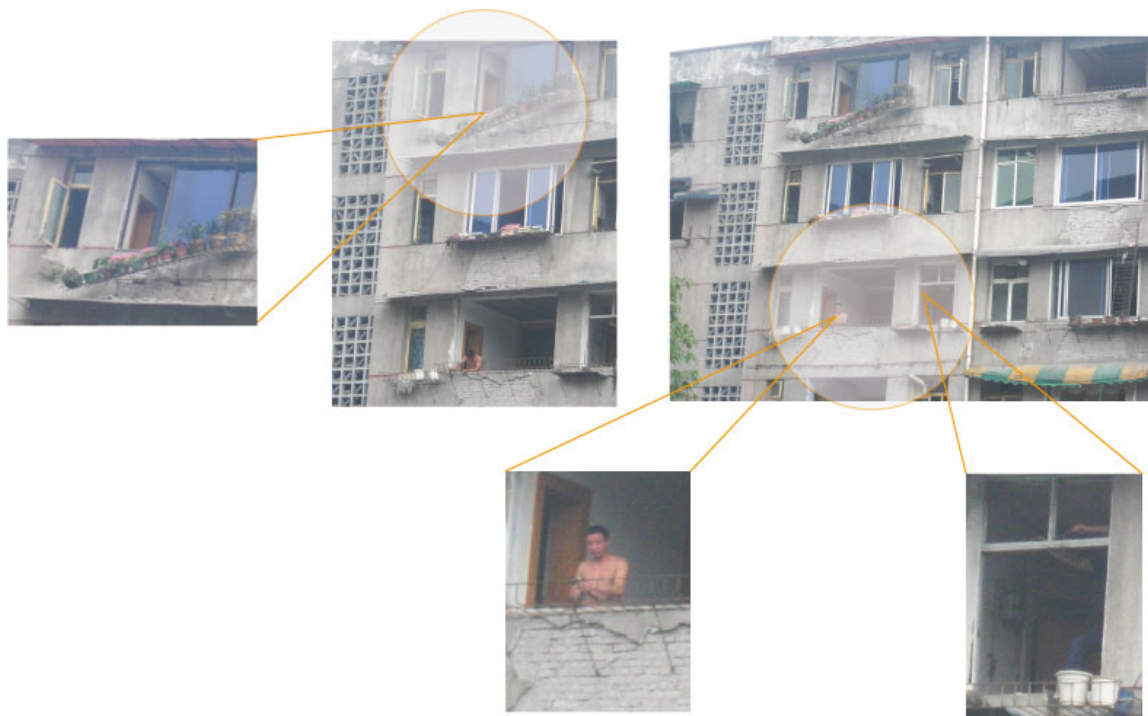
Photograph5. Danger posted by the Falling Objects