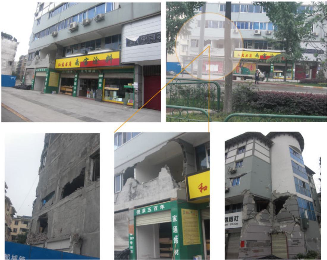
Photograph4. Dangerous Business