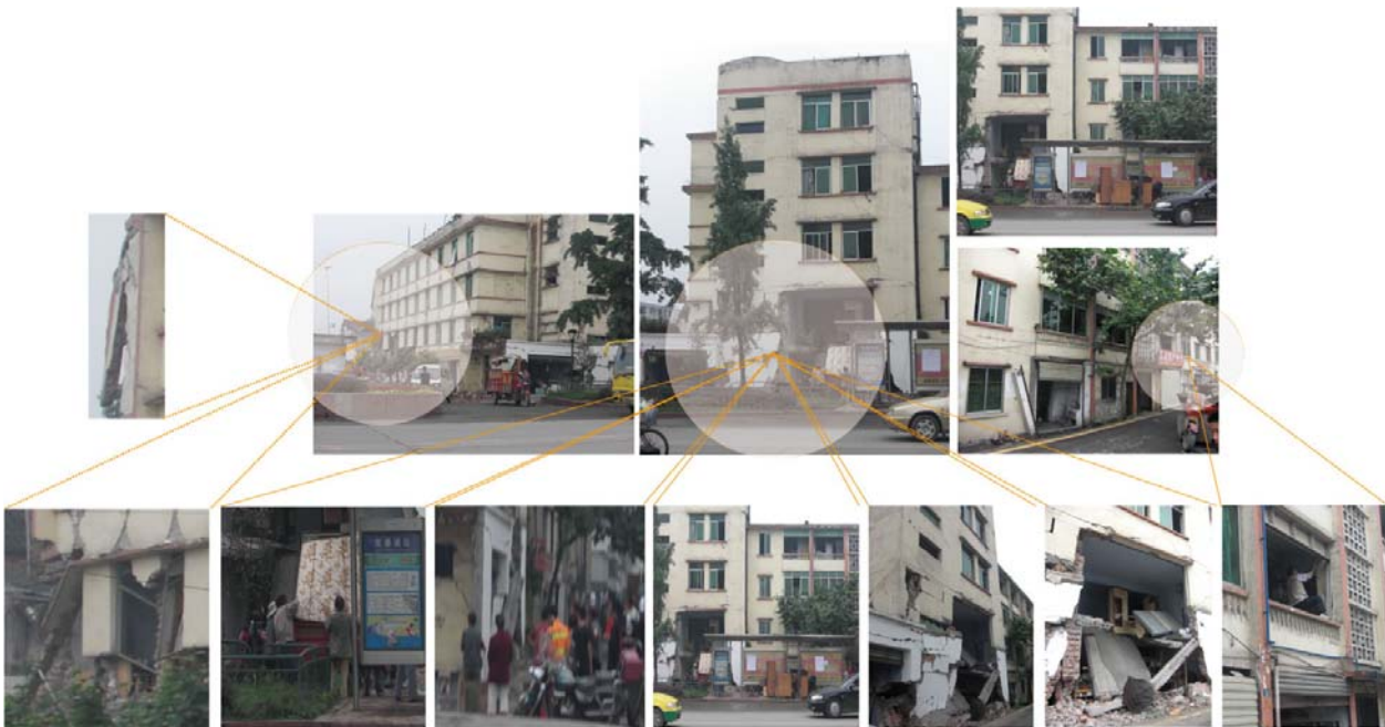
Photograph3. Dangerous Action