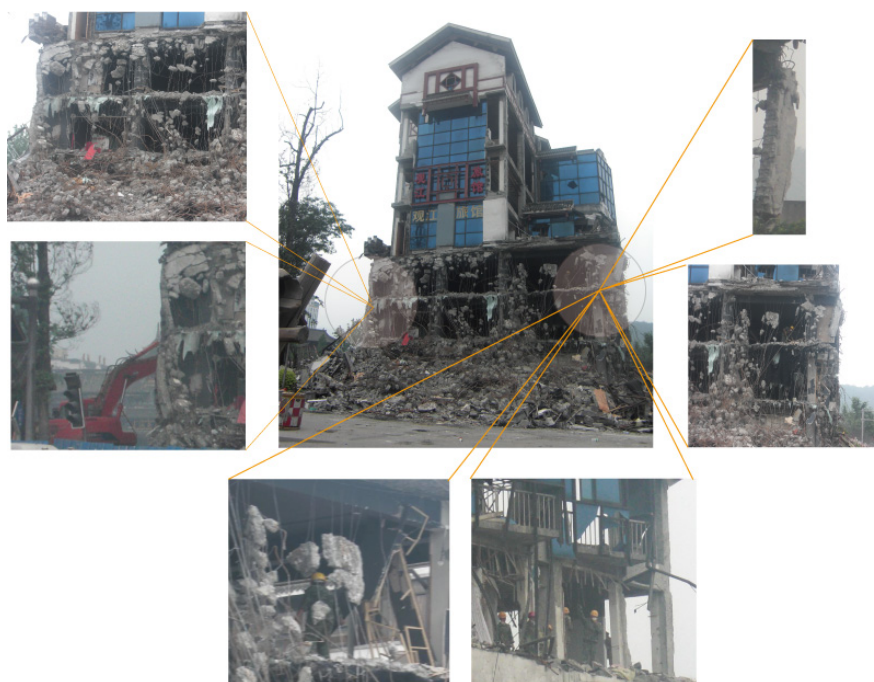
Photograph1. Dangerous Demolition