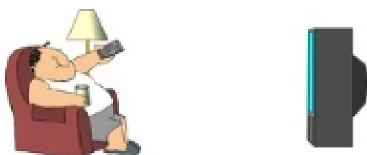
Fig. 3 People want to be relaxed when watching TV

Elderly people usually have very limited experience with technology, and therefore, a considerable tradeoff between simplicity and functionality is highly required. The system must have easy to use interface with simple navigation patterns and minimal rarely-used functions. Complex interactions must be avoided for easy performance of the desired actions [12]. As shown in Figure 3, people intentionally want to be relaxed and comfortable when watching TV. Thus, any difficulty in using the device will be a barrier to its acceptance.