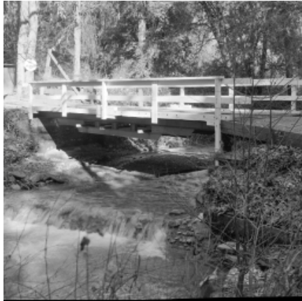
Figure 2. Bridge (256x256).

Fig. 6 illustrates the average running time per training vector per iteration. These results include not only the time needed for the distance computations, but also the time needed to sort the rows of the distance matrix in TIE, and thus TIE performs even worse. Overall, our M-tree variant clearly outperforms both TIE and simple GLA in clustering tasks involving a large number of clusters.