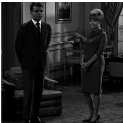
Figure 4. Couple (256x256).