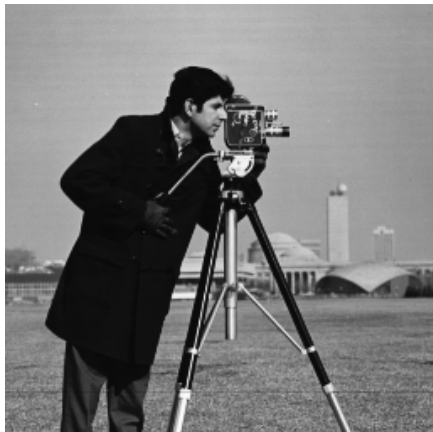
Figure 3. Camera (256x256).